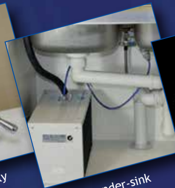
Ideal for under-sink installations