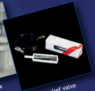
Pressure relief valve kit included